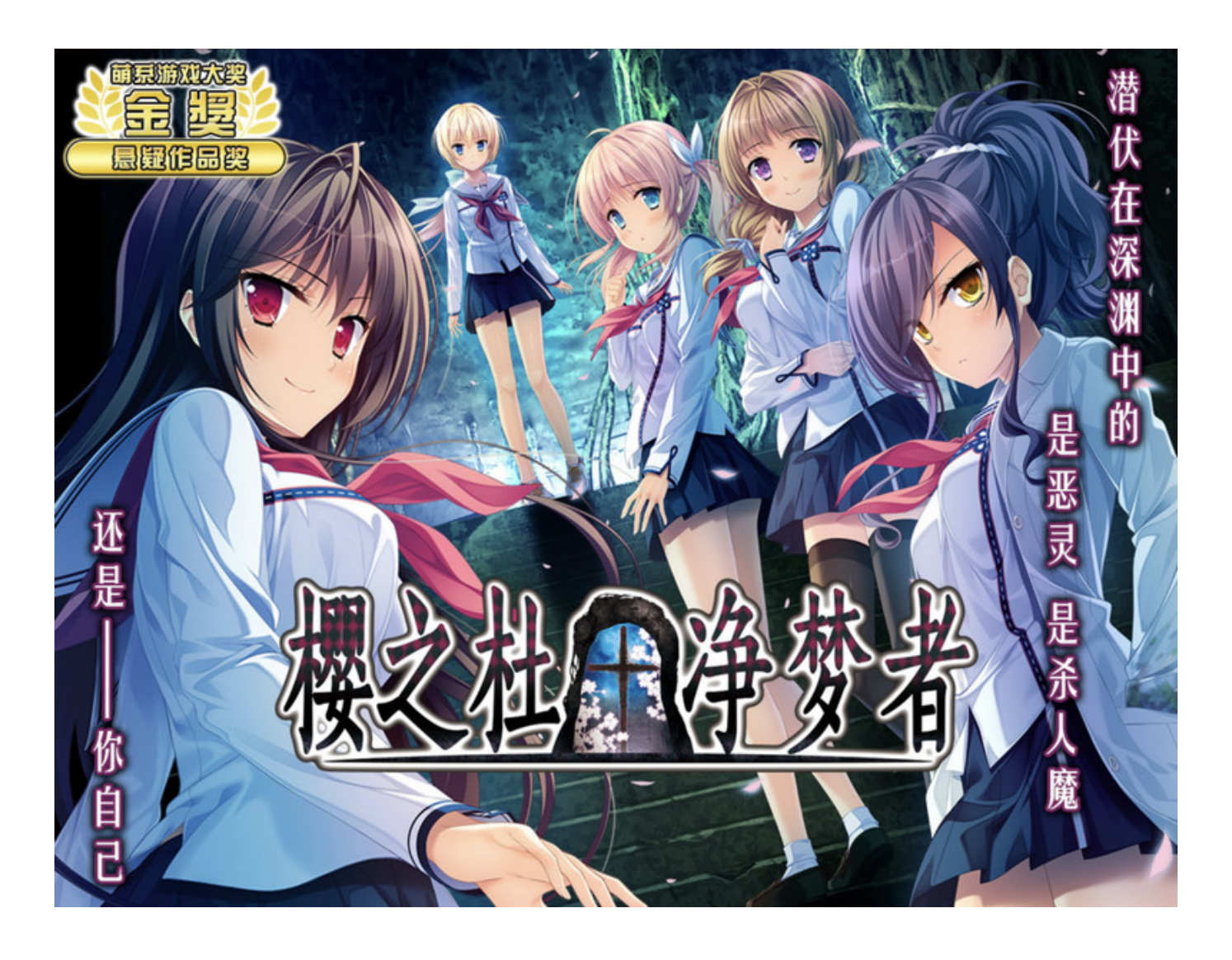
Flipped On Download] [License]

Download ->>->> <a href="http://bit.ly/2Jm1UsO">http://bit.ly/2Jm1UsO</a>